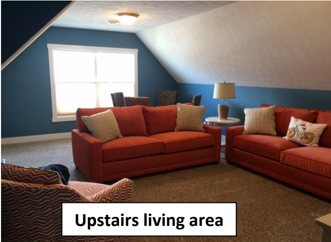
Upstairs living area