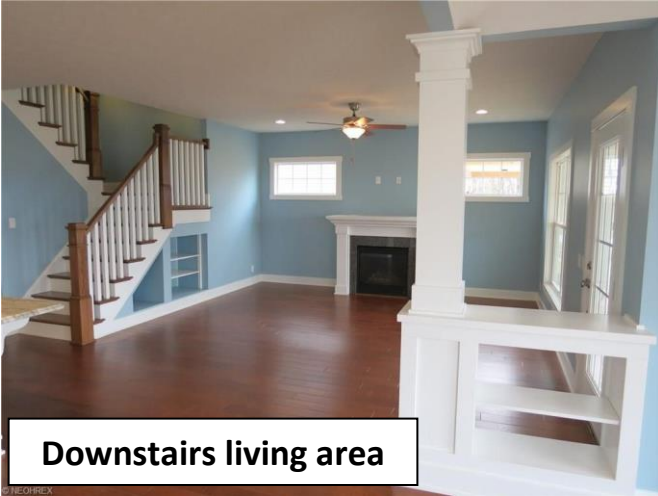
Downstairs living area

10948 E. Bayshore Road Marblehead, OH 43440